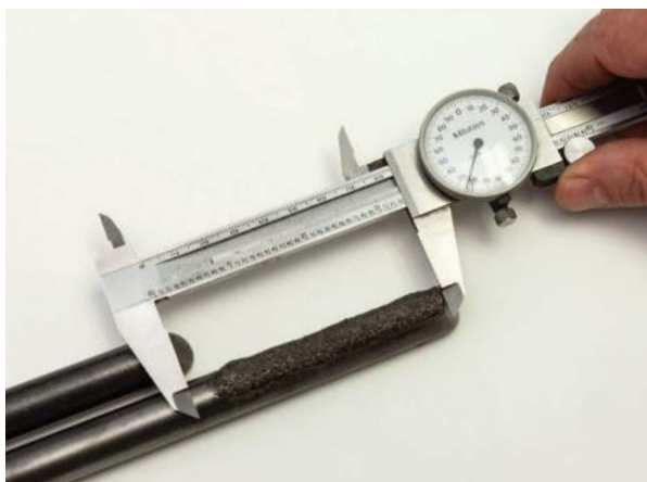
10,000 acres of wear comparing a MAX LIFE tine to a regular tine.

Our lineup is always expanding. Ask your dealer, or contact us, for the latest additions.