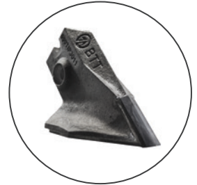
3" REPLACEABLE TIPS