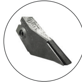
3/4" REPLACEABLE TIPS

Conventional and heavy-duty openers give you options for applying anhydrous ammonia, liquid, dry, or a combination of fertilizer products. Choose from bolt-on or knock-on ( Speed-Loc™ ) knives with welded or replaceable tips in regular and non-freeze NH 3 options.